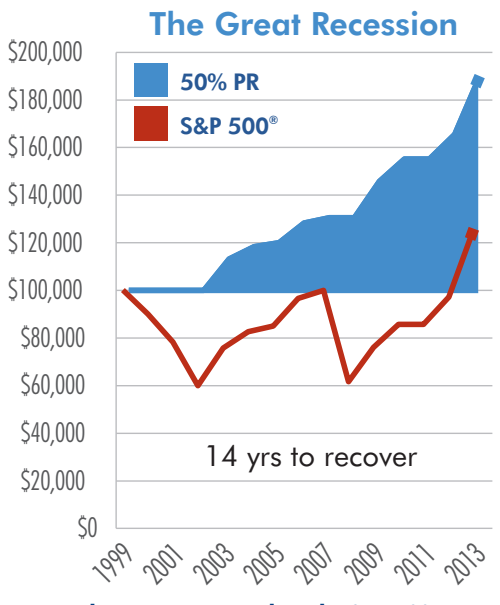
Without protection, when the S&P 500® experiences a correction, it can take several years to return to the previous value.

For demonstrative purposes only. Participation rates can change annually. The graph is based on actual rates for the time period shown for the S&P 500® only. Past performance does not guarantee future results. Indexed annuities were not available for the entire period shown, except for 1995-Present. The hypothetical fixed index annuity in this example uses the annual point-to-point index method based on changes in the S&P 500® to calculate the indexed rate for each term. For purposes of these charts an Annual Point to Point 50% Participation Rate is applied for all terms in the period. Assuming $100,000 initial premium. Indexed interest is credited only on amounts held for the entire term. This example assumes no money is withdrawn from the annuity. Surrender charges will apply if money is withdrawn during the surrender charge period.